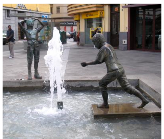
CHILDREN PLAYING WITH WATER

They are located in Isla Gran Canaria Street, in Valsequillo, Gran Canaria. Spain.